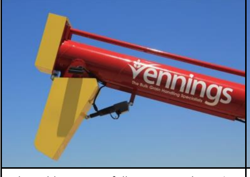
Adjustable spout in fully contracted position