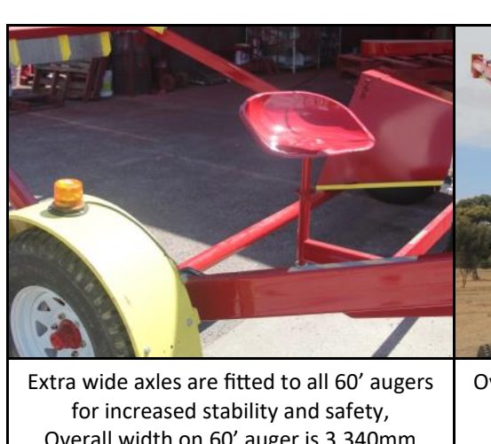
Overall width on 60' auger is 3,340mm