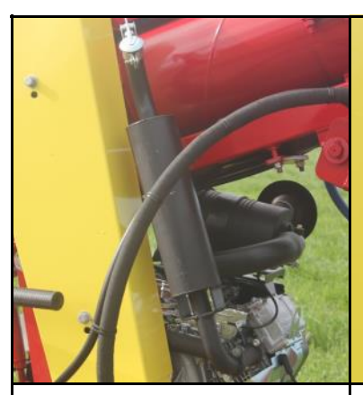
A newly deigned manifold and exhaust has allowed us to directly attach the muffler to the manifold without the use of flexible tubing.