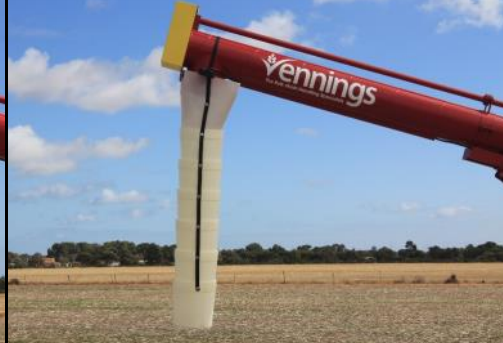
Optional 7 Section drop spout with approximately 1500mm drop