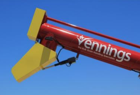
Adjustable spout in fully extended position