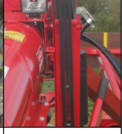
Three belt drive with belt guides behind the belts that hold the belts when they are out of gear