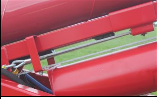
An extra pulley has allowed us to have the hydraulic cylinder rod inside the hydraulic cylinder barrel when the auger is in its resting/transporting position so the rod is not exposed to the elements reducing the risk of the cylinder rod pitting or bending in transport.