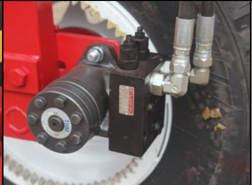
A motion control valve has been added to the drive motor, providing a brake like function on the third wheel, allowing easier control and restricts the roll back when entering the silo, without roll on/back.