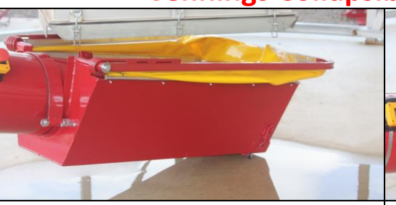
Collapsible hopper in lowered position 420mm from bottom of hopper to top of canvas