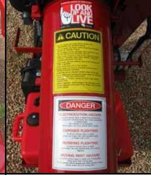
Safety operating stickers to promote safety