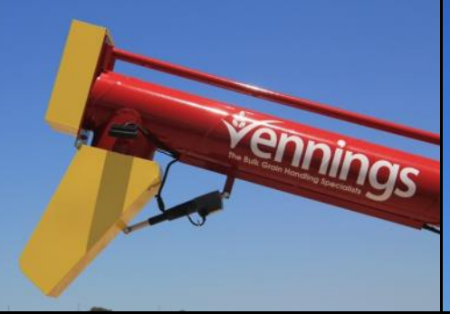
Adjustable spout in mid position