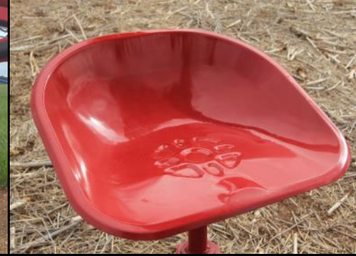
Simply sit on the swivelling seat & drive around