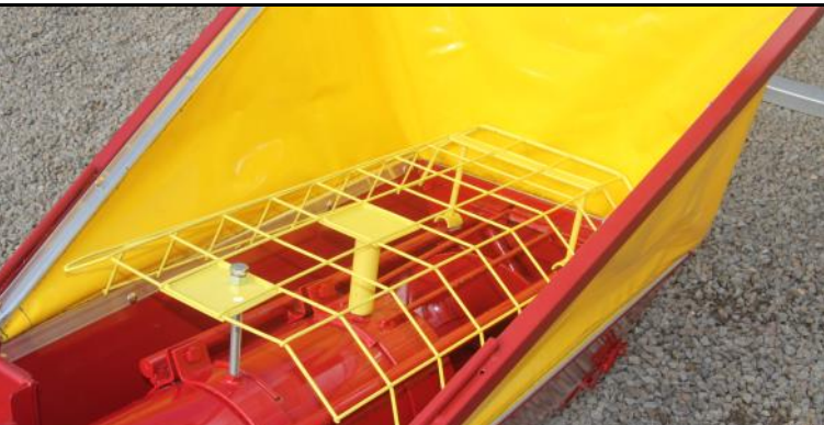
Fitted with removable safety mesh