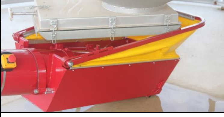
Hopper in raised position maximum height of 820mm from bottom of hopper to top of canvas