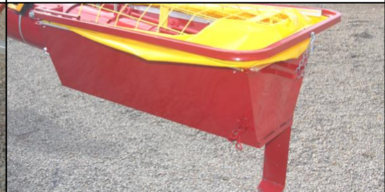
Cleanout trapdoor on bottom of hopper