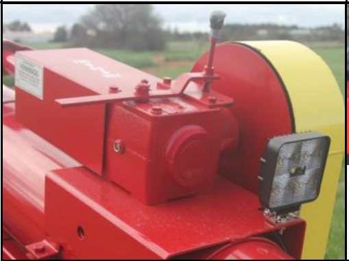
Reversible gear box standard on all Vennings augers. One of the two 1200 lumen Led Lights fitted to all Self Propelled Augers