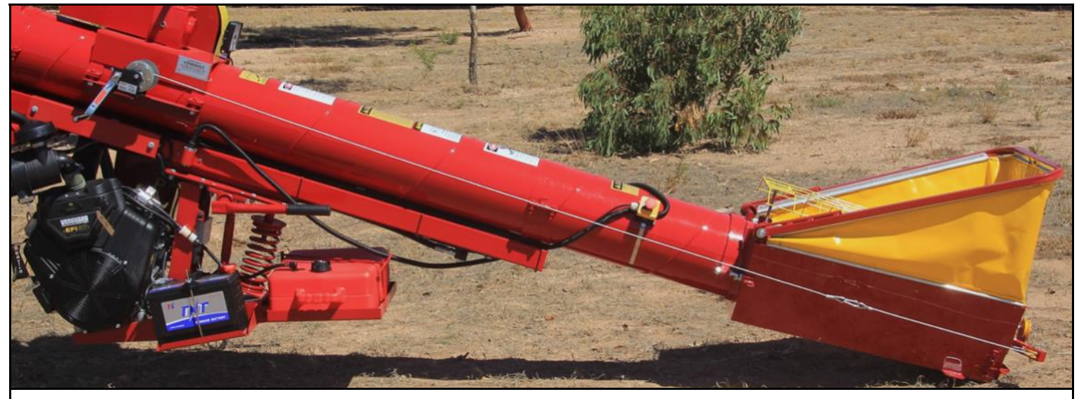
Winch adjustable collapsible hopper in raised position. Simply wind the winch to collapse the hopper into its lowered position