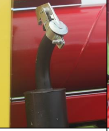
Exhaust with rain cap fitted After market upgrades for existing augers are available