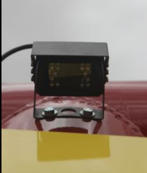
Optional Camera fitted to outlet of auger