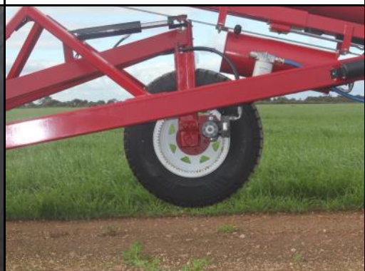
Third wheel in transport position. There is no need to disconnect drive wheel or brakes.