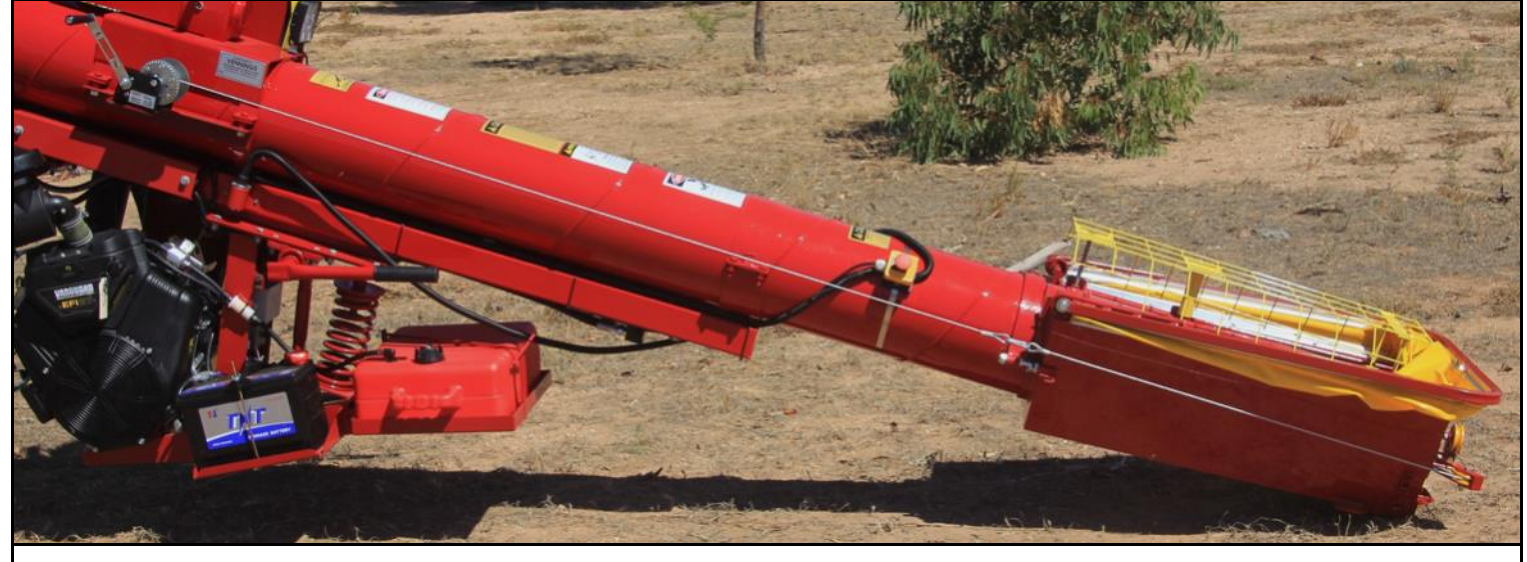
Winch adjustable collapsible hopper in lowered position

Vennings new collapsible detachable grain hopper attached and detaches in seconds. It can be used in any height between 420 & 820mm by adjusting the chain & hook or winding the winch.