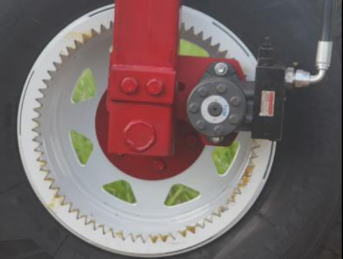
Heavy Duty 20mm thick gear drive on third wheel with Heavy Duty NEW 31X10.5R 15LT 6 Ply Tyres