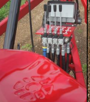
Seat and controls