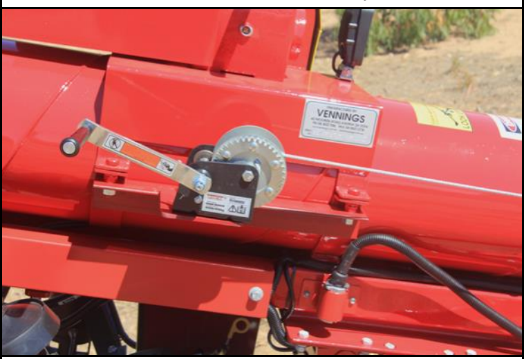
Optional winch adjustable allows the hopper to be raised & lowered without climbing under silo