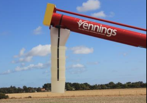
Optional 5 Section drop spout with approximately 1100mm drop