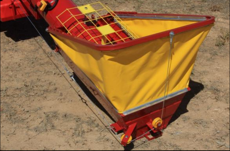
Hopper in raised position with wire rope & pulleys.