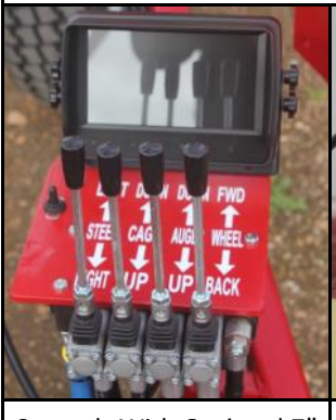
Controls With Optional 7" Waterproof Monitor