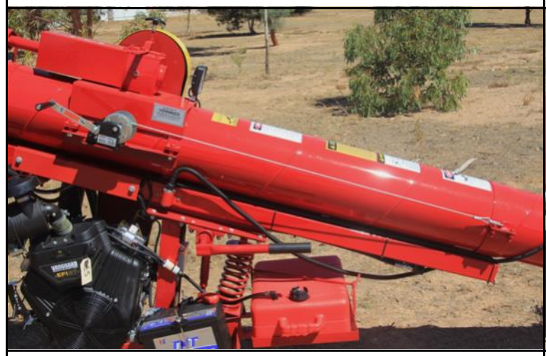
Winch and wire rope in transport position. Winch and Hopper have two separate ropes