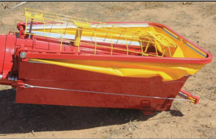
Hopper collapsed ready for transport wire rope holds the hopper down.