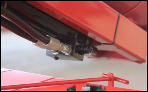
A newly designed hydraulic cylinder with built in counter balance valve.