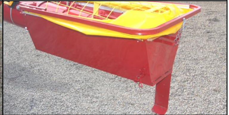
Cleanout trapdoor on bottom of hopper