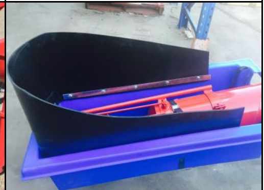
Poly Hopper with rubber top. Slender design allows auger to be placed under silo with the hopper attached to the auger.