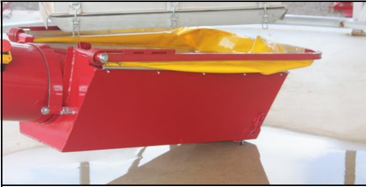
Collapsible hopper in lowered position 420mm from bottom of hopper to top of canvas