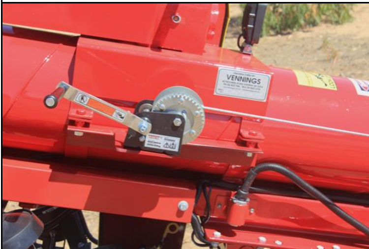
Optional winch adjustable allows the hopper to be raised & lowered without climbing under silo