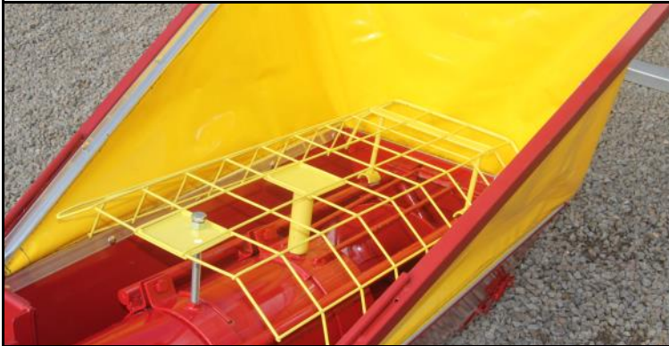
Fitted with removable safety mesh