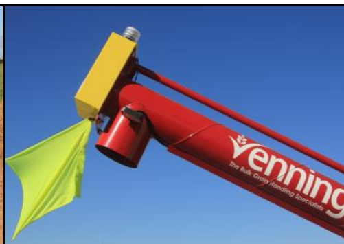
A flag is fitted to the end of all augers. A LED revolving light is fitted to the top end of all 42', 50' & 60' Augers as per legal requirements (not req. on 35' as it's not oversize)