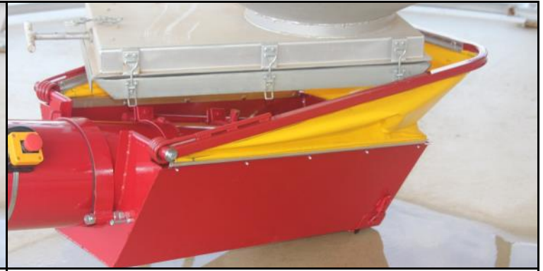
Hopper in raised position maximum height of 820mm from bottom of hopper to top of canvas