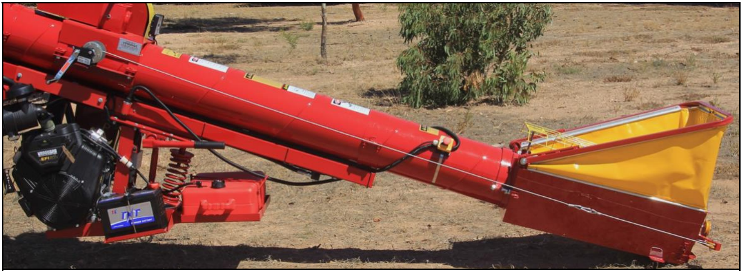
Winch adjustable collapsible hopper in raised position. Simply wind the winch to collapse the hopper into its lowered position