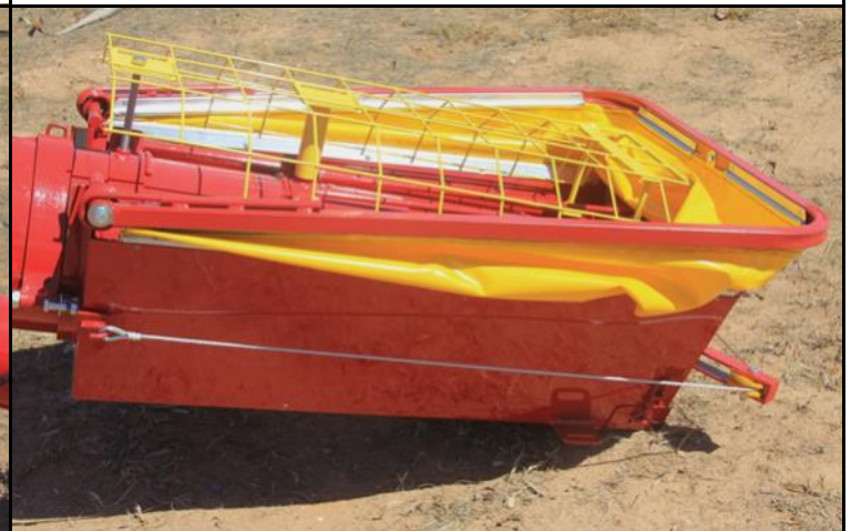
Hopper collapsed ready for transport wire rope holds the hopper down.