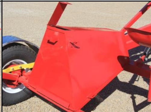
Steel hopper in transport position mounted to bottom frame so its always with auger.