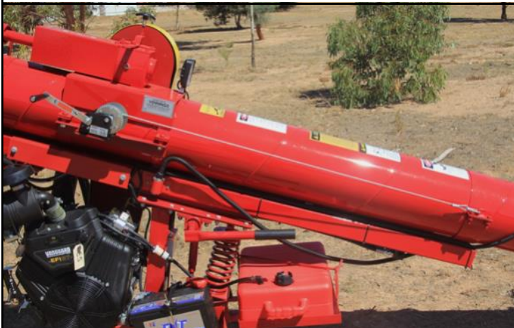
Winch and wire rope in transport position. Winch and Hopper have two separate ropes