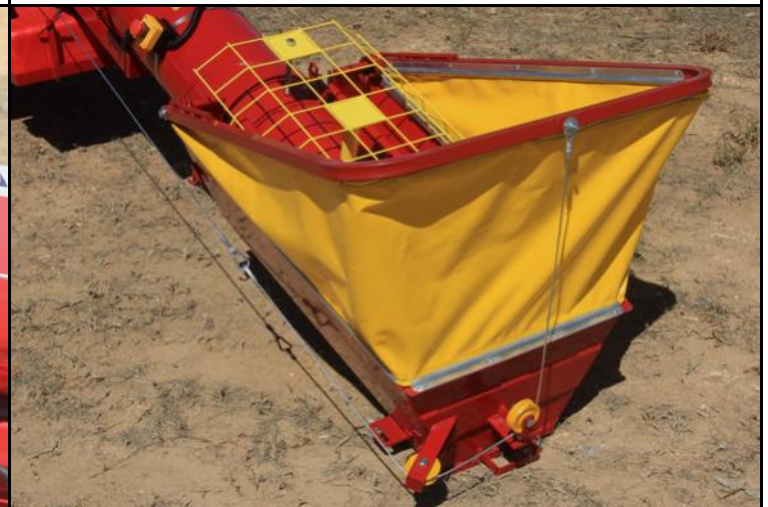
Hopper in raised position with wire rope & pulleys.