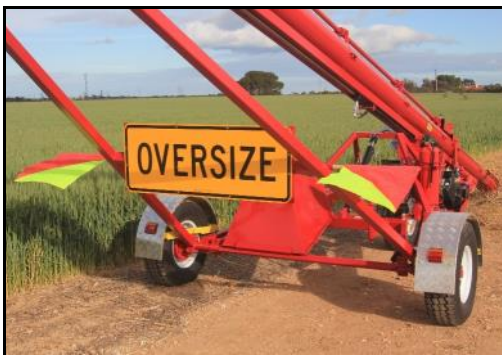
Oversize sign & flags showing width extremities are fitted to 42', 50' & 60' Augers (not req. on 35' as it's not oversize) All augers have safety towing chain & D Shackles