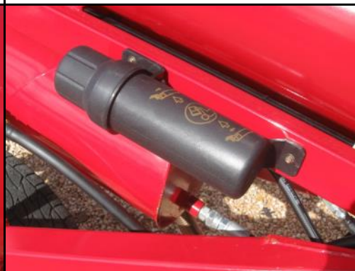
Document holder attached to Auger holds motor and auger operating instructions