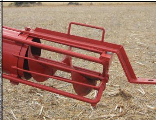
Safety Cage with removable tow hitch