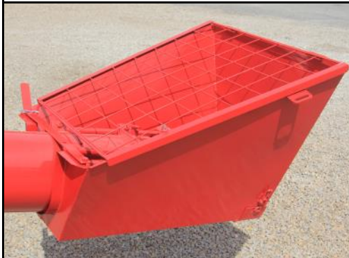
Standard Steel Hopper with safety mesh with cleanout trapdoor fitted