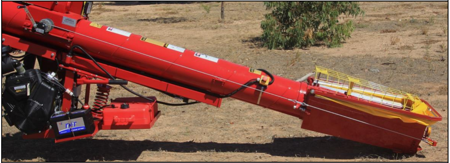
Winch adjustable collapsible hopper in lowered position

Vennings new collapsible detachable grain hopper attached and detaches in seconds. It can be used in any height between 420 & 820mm by adjusting the chain & hook or winding the winch.