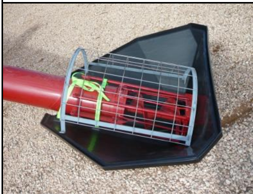
Optional plastic hopper is available but has been proven to decrease capacity