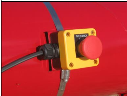
Emergency Stop Switch fitted near intake end of auger