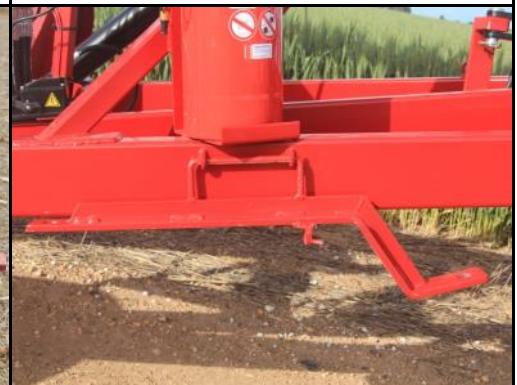
Tow hitch in storage when not in use