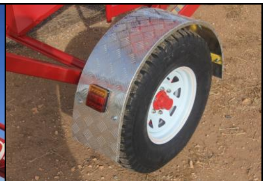
Optional aluminium mudguards with LED tail, brake & indicators can be fitted. Standard with heavy bearings rated at 1600 kgs.